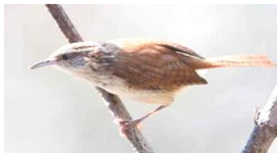
Red-backed fairy Wrens (鸂鶒), which live in northern and eastern Australia, lay three or four eggs at a time.

Before birth, babies can tell the difference between loud sounds and voices. They can even distinguish their mother's voice from that of a female stranger. But when it comes to embryonic learning (胎教), birds could rule the roost . As recently reported in The Auk: Ornithological Advances , some mother birds may teach their young to sing even before they hatch(孵化). New-born chicks can then imitate their mom's call within a few days of entering the world.